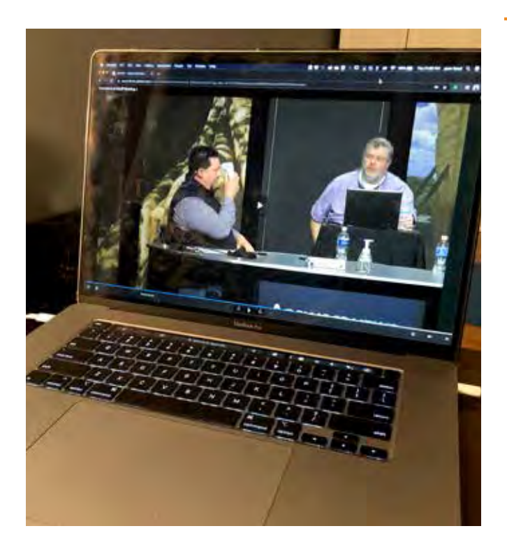
Training in new processes and procedures will be provided based upon the roles of the individual staff member. All staff

The Creation Museum playground is open to guests, following the practice of local government officials in the reopening of playgrounds. The playgrounds will be regularly cleaned/sanitized, and we encourage guests to practice proper safety measures with social distancing and using the available hand sanitizer. We ask that parents take precautions as needed to ensure their child's safety.