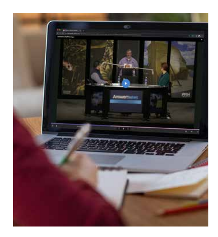
and efficient way to train based on the procedures being taught.

Training will take place in a manner that ensures proper social distancing and will focus on virtual and online approaches as priority. Hands-on training will be limited to situations where it is the most effective