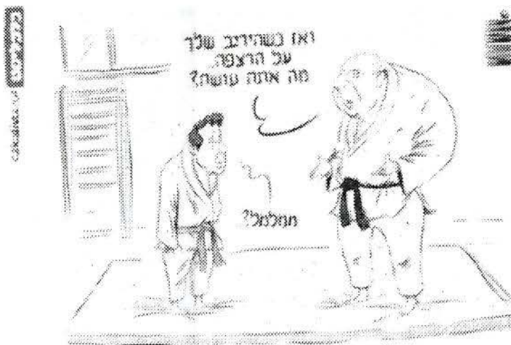
Calcalist (2/3) by Yonatan Wachsmann; Trainer to Herzog: "And when your rival is on the floor... what do you

Click to jump: Prime Minister's Residence | Israeli Public Diplomacy | #IsraElex | Iran | Rivlin in Hebron | Jordan – Israel | Schabas | Operation Protective Edge | ICC, Settlements | Haredim | Block Quotes