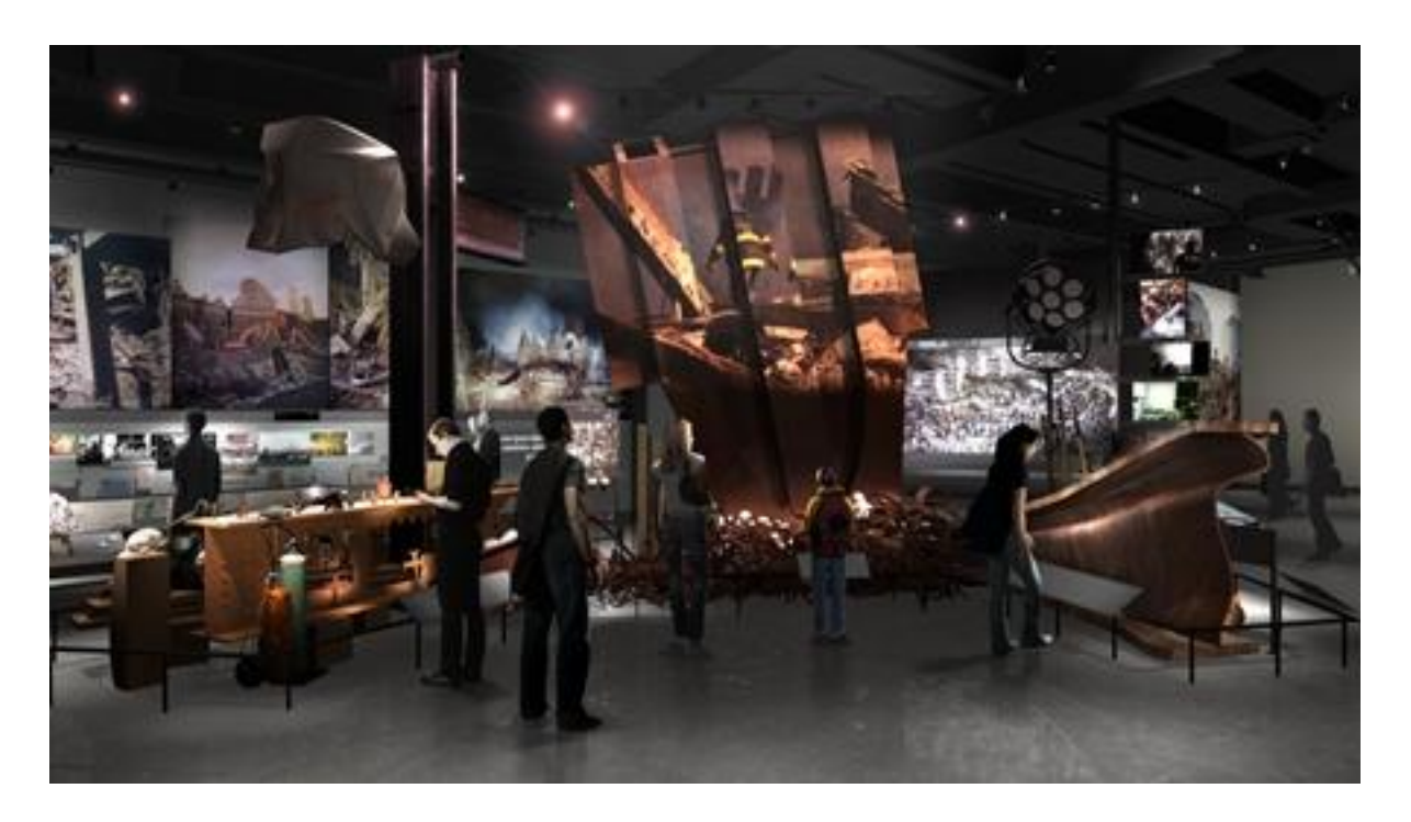
The Museum Exhibition Design, 9/11 Memorial, <a href="http://www.911memorial.org/museum-exhibition-design-1">http://www.911memorial.org/museum-exhibition-design-1</a> (last visited Aug. 14, 2012).

Port Auth. of N.Y. & N.J. (N.Y. Sup. Ct. 2011) (Index No. 108670-2011). The Museum's website shows how the cross is to be exhibited: